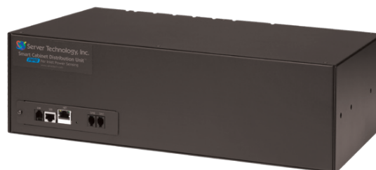
Rear View: Network, serial, and environmental ports.