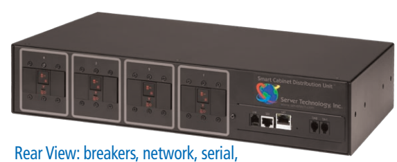
Rear View: breakers, network, serial, linking and temperature/humidity inputs

Expansion Module Model Numbers > CL-4HDX452B6 > CL-4HDV452B6 > CL-4HYY452B8